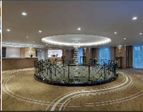
HILTON MEETINGS LOBBY