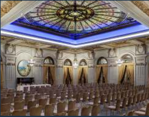
LE DIPLOMATE BALLROOM