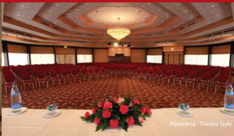
Panorama - Theatre Style