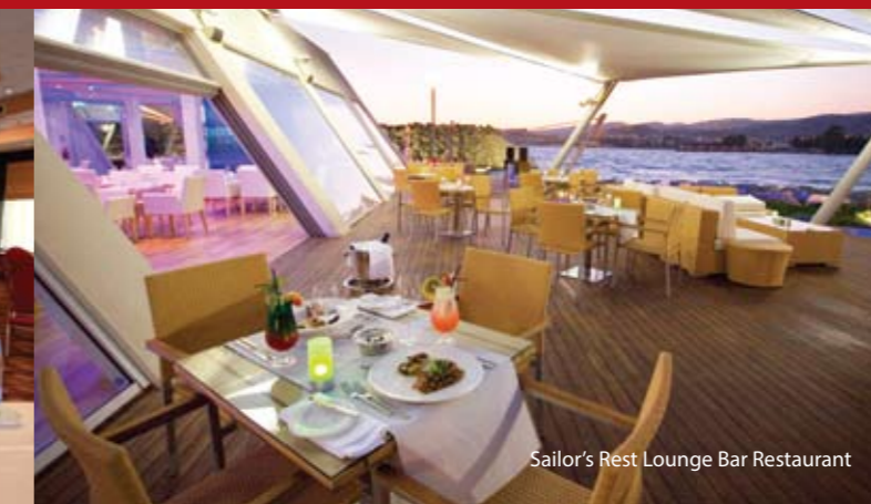
Sailor's Rest Lounge Bar Restaurant