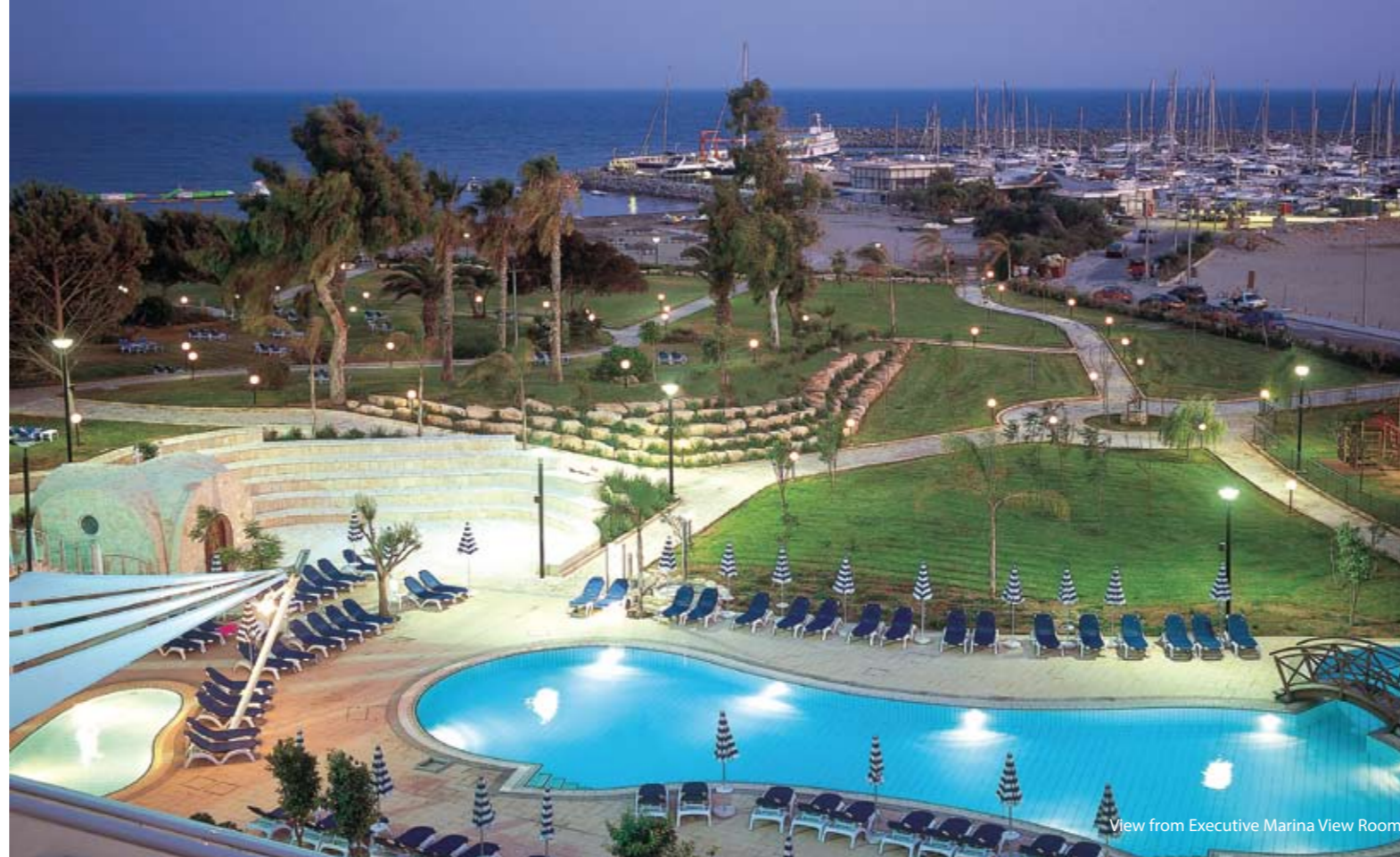
View from Executive Marina View Room