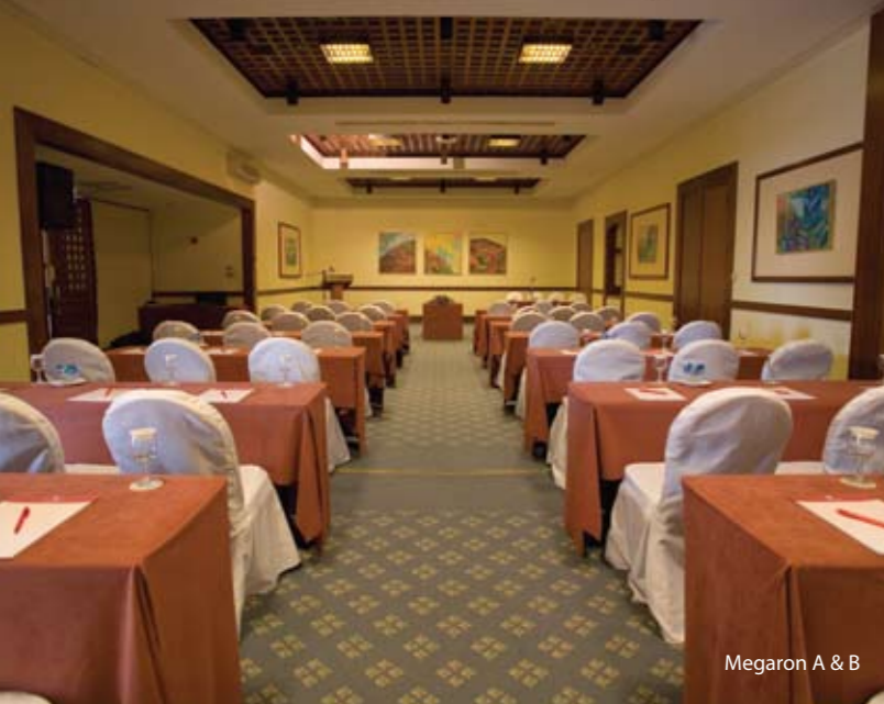
Megaron A & B

With 43,000 square meters of landscaped gardens and a large sandy beach, the resort is an oasis of pleasure for those who wish to relax or for those who are sports enthusiasts. The resort features two floodlit tennis courts, a health club and spa with a new fully equipped gymnasium, sauna, steambath, Jacuzzi, solarium and Thalgo Spa Treatments. Swimmers can choose between the two outdoor swimming pools, one indoor swimming pool or the sea. There is also an array of activities such as beach volley, water sports, badminton, archery plus many more.