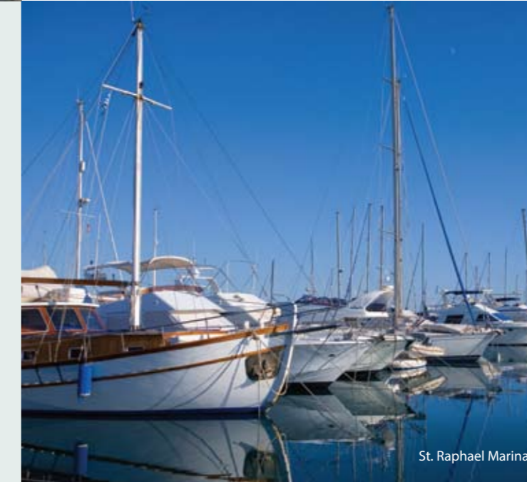
St. Raphael Marina