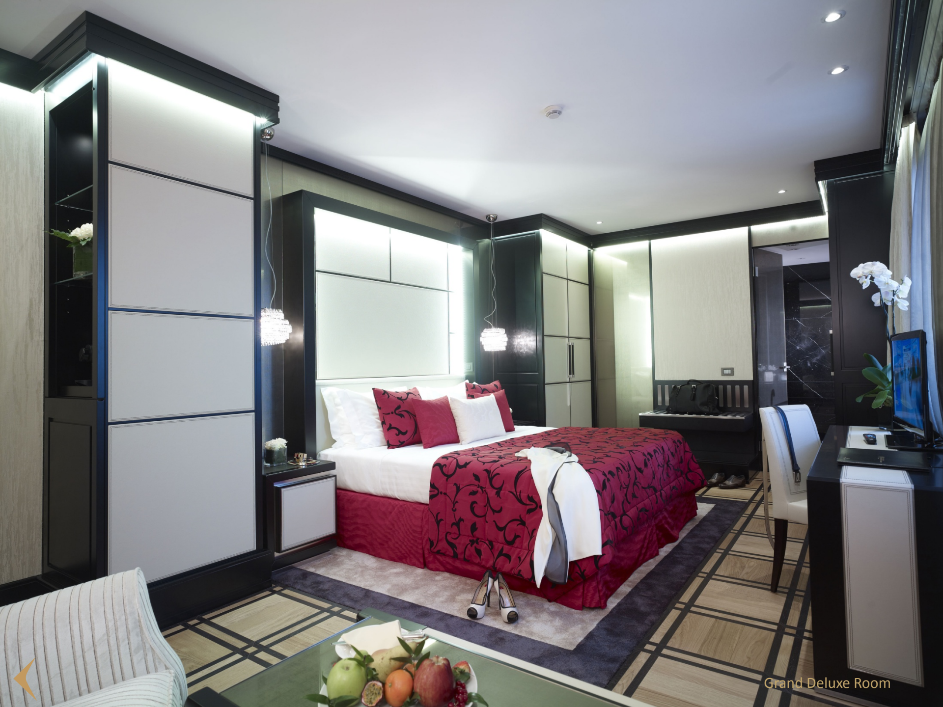
Grand Deluxe Room