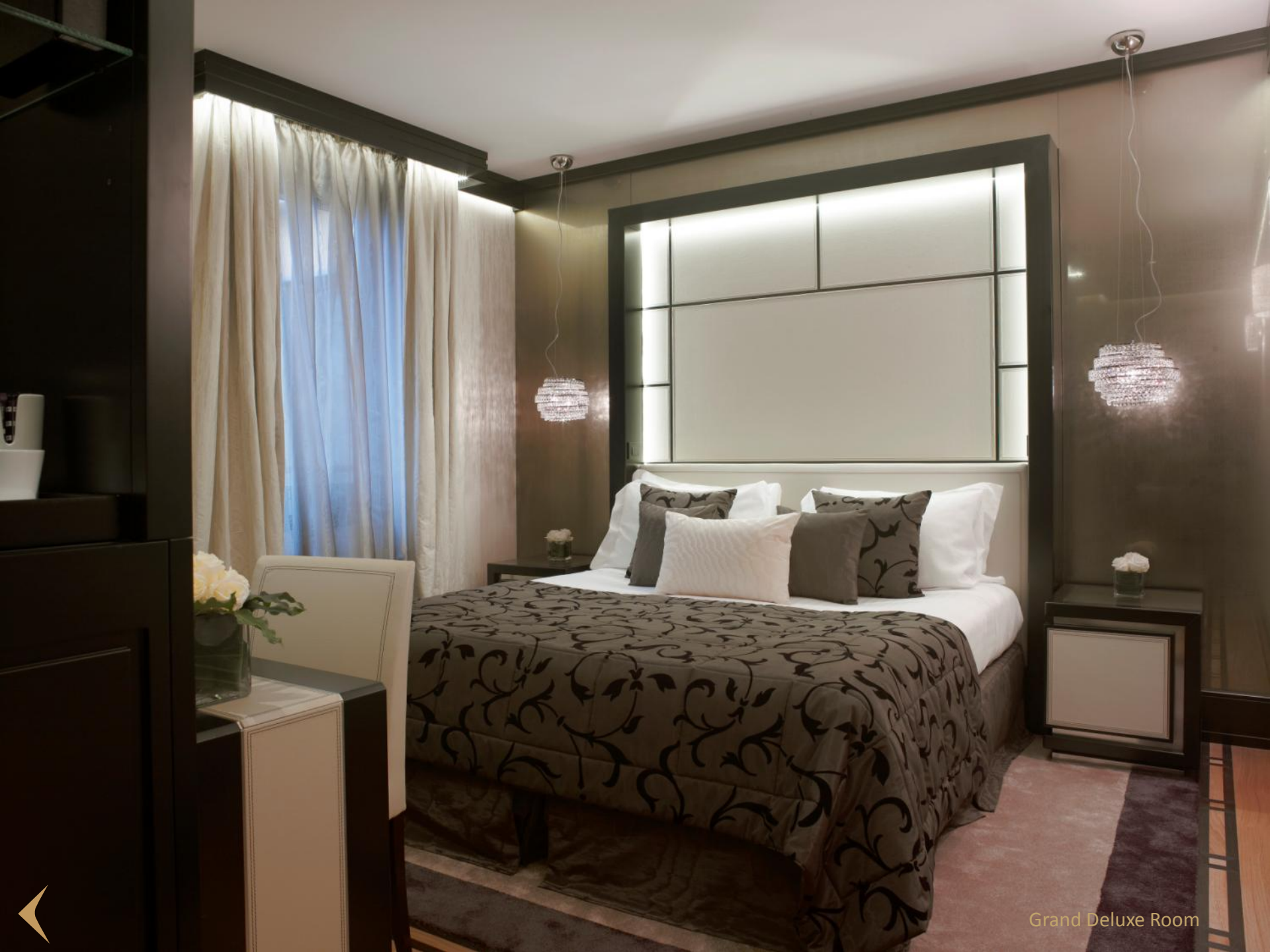
Grand Deluxe Room