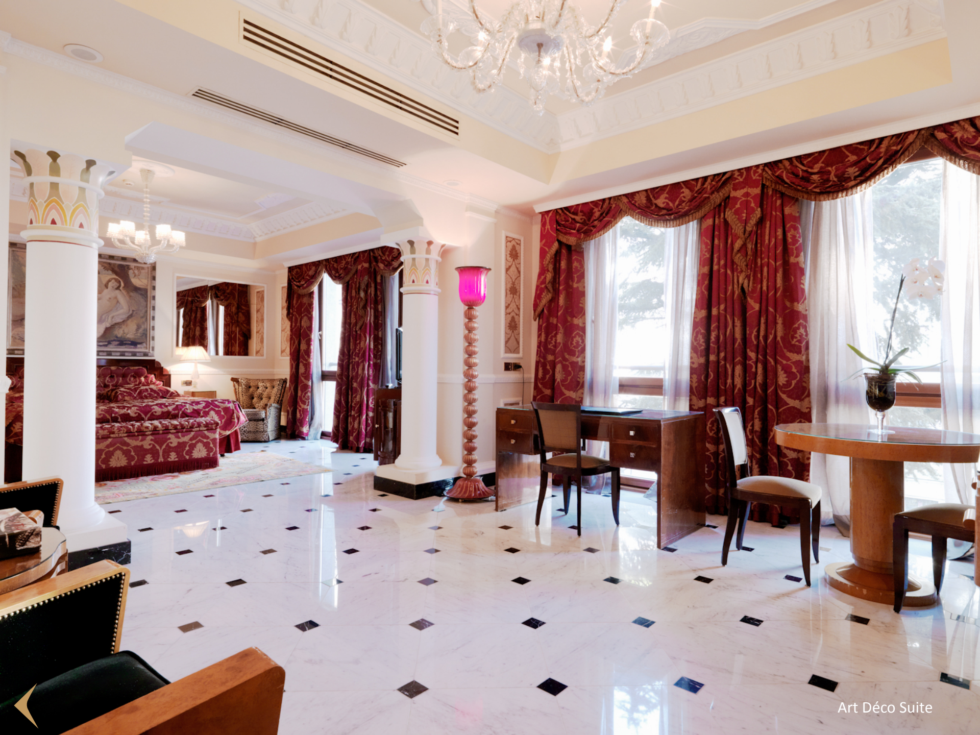
Art Déco Suite