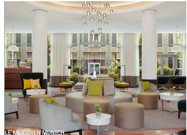
LE MERIDIEN MUNICH