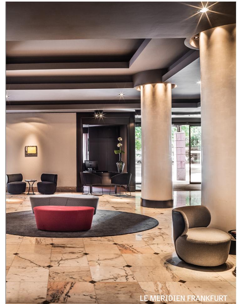
LE MERIDIEN FRANKFURT