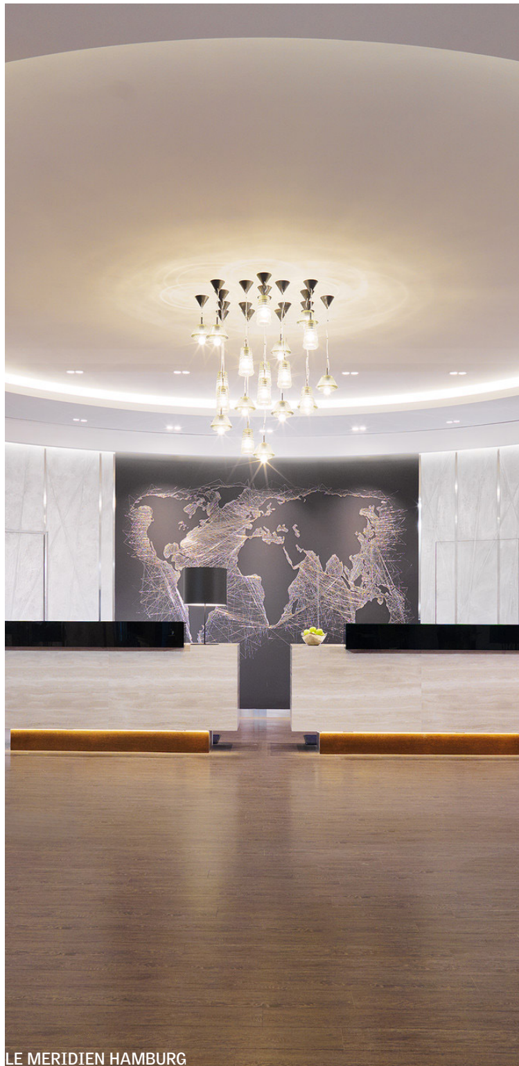
LE MERIDIEN HAMBURG

293 rooms & suites | 8 meeting rooms lemeridienvienna.com