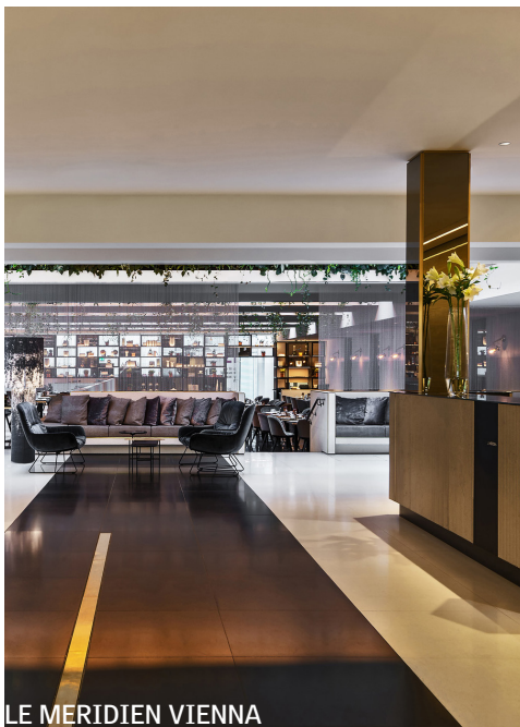
LE MERIDIEN VIENNA