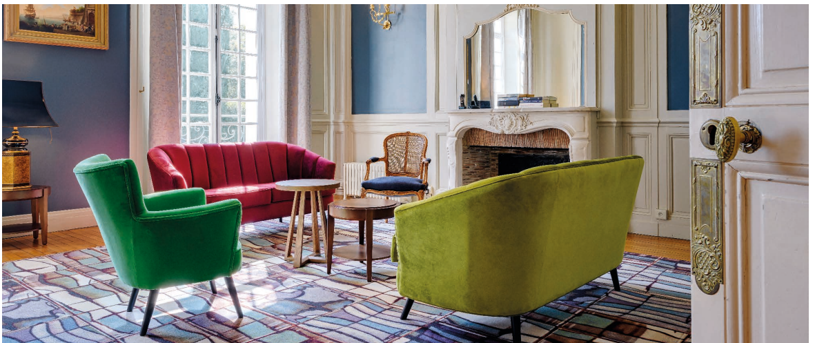
Château de Fillerval - Rue du Lavoir - 60250 Thury-sous-Clermont