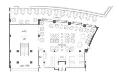
PEACOCK'S GRILL & BAR

The main restaurant of the resort can be used as an exclusive function space, with an opening on to the terrace that is located adjacent to the pool. It can accommodate a multitude of functions such as working lunches, banquets or serviced meetings.